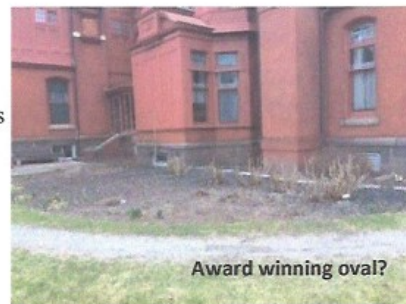
Award winning oval?