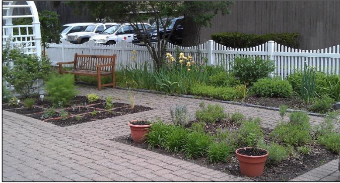
Two sections of the herb garden at the Bergen County Zoo.

The plots must be weeded, watered, and otherwise taken care of. Some plants are perennial; others are planted in the spring for the entire season. Typically, two volunteers show up, but they aren't Master Gardeners.