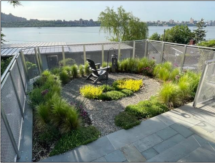
Southeast view: Manhattan.