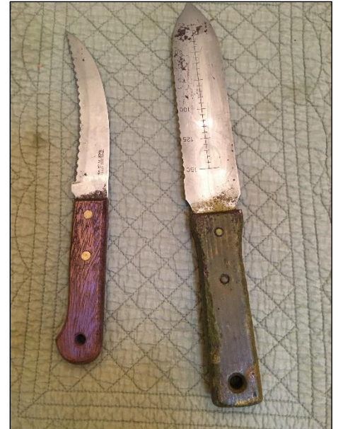
Fall faves: Janet's curved, serrated knife (left) and hori hori knife.

The curved, serrated knife is indispensable for cutting hosta leaves as well as any other perennials that need to be cut down in the fall. The hori hori knife is great not only for planting bulbs but also for digging out the roots of weeds.