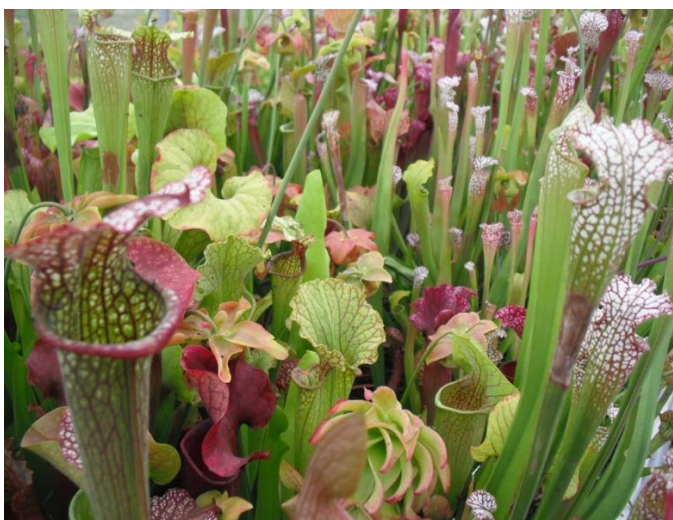
A display of pitcher plants.

Refreshments at 7 pm Announcements at 7:20 pm Program to follow