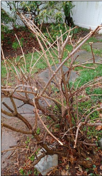
Look closely: Tree hydrangea pruned in early March exhibits new growth.

Many shrubs should be pruned at the end of the winter or in early spring. Pruning falls into two categories. There's regular pruning done to keep shrubs under control and to encourage summer flowering and pruning done to renovate older plants.