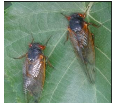
Adult periodical cicadas.

2021 marks the return of the 17-year locust. Get ready for the ceaseless whirring of the male cicadas beginning in late May or early June. Click here to read the Rutgers Agricultural Extension Service's revised factsheet about these noisemakers.