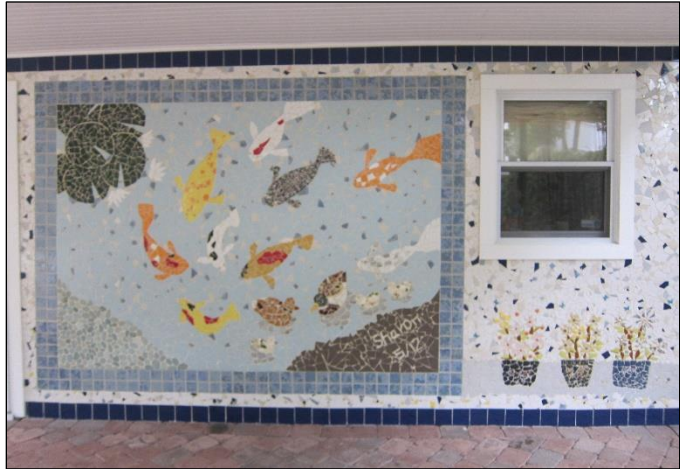
Another upcycling project: Sharon's mosaic wall comprising broken china and pottery.

My proudest project in my garden is the mosaic wall that I created in 2012. I turned broken china and pottery into something beautiful instead of putting them in the garbage.