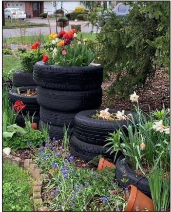
Sharon upcycled old tires into planters.

One of the upcycle projects that I made in my garden is the tire planters [that] I created along the edge of my lawn four years ago. It gives an interesting dimension in height and in materials. The ability to take garbage out of a landfill is most motivating.