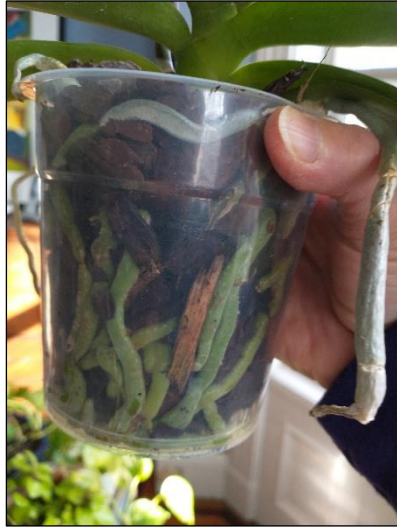
This Phal does not need to be repotted!